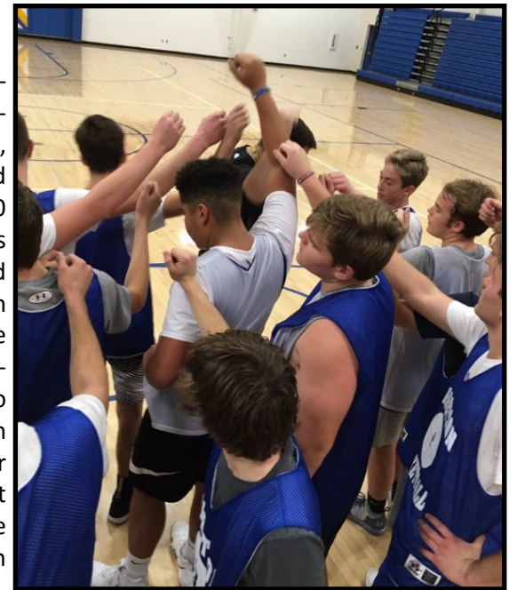
The boys basketball team breaks it down at the end of another practice. The Blue Dragons have been putting in countless hours of work in the gym and weightroom to prep for their 2018-2019 campaign.

Overall it should be an exciting season to watch. There will double header on December 7 vs Tri-Valley at Garretson.